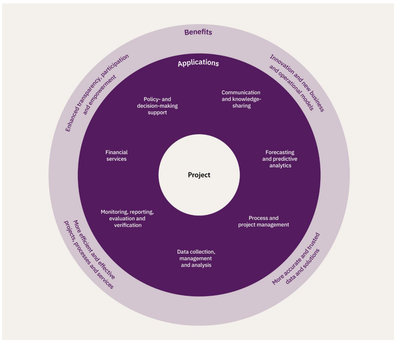
Figure 2: Applications and benefits of digital technologies